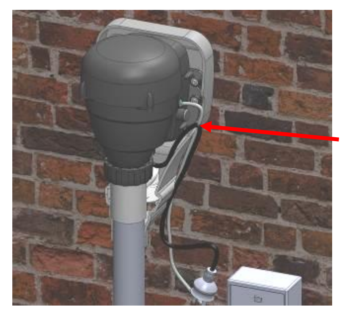
Step 3 Mount the pre-assembled base and blower to the wall. Make sure that the plug lead, air tube or touch pad cable are located in the correct position (see diagram)

Ensure power lead, air tube or touch pad cable are located here.