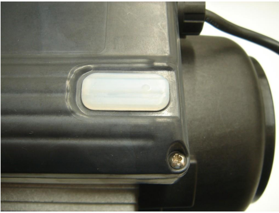
Refer to Step 3